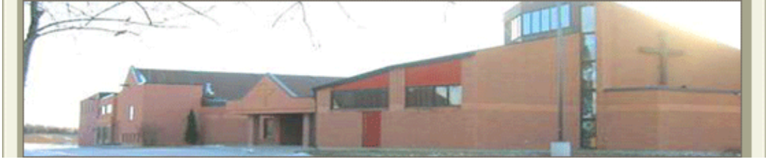
Map to Christ Anglican Church, 254 Sunset Blvd., Stouffville, Ontario